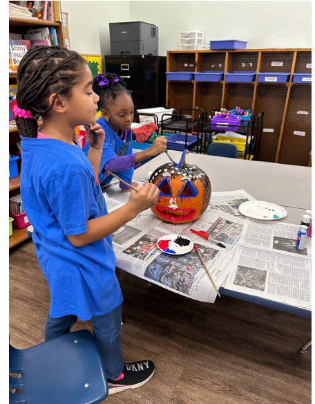
Finally K-2 painted their pumpkin to make it a scary pumpkin ghoul!!