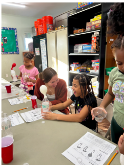
Investigating chemical reactions. Inflating a balloon with baking soda and vinegar

Our intrepid scientists in Grades 3-5 participated in some S.T.E.M explorations. (Stem is an acronym for Science, Technology, Engineering, and Math). Students got to make a hypothesis (educated guess) about the outcome, and then tested to see if their predictions were correct or, in fact, did not hold up.