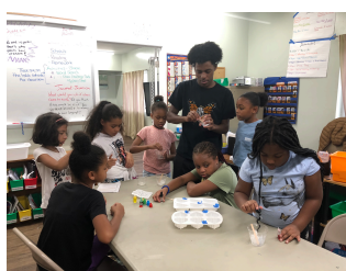
Making lemon scented soap