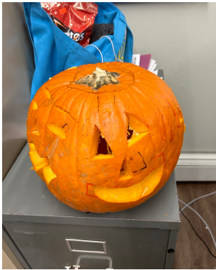
Gr. 3-5 made a 3 faced Jack O' Lantern creepy at any viewing

On Halloween, the students in each class, ( K-2 and Gr. 3-5) carved a large pumpkin into a Jack O' Lantern. Then, to make their pumpkin face even scarier, the K-2 students painted it, and created a terrifying ghoul !