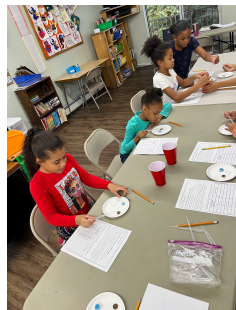
Exploring surface tension. How many water drops could fit on a penny