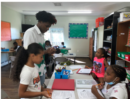
Homework Grades 3-5