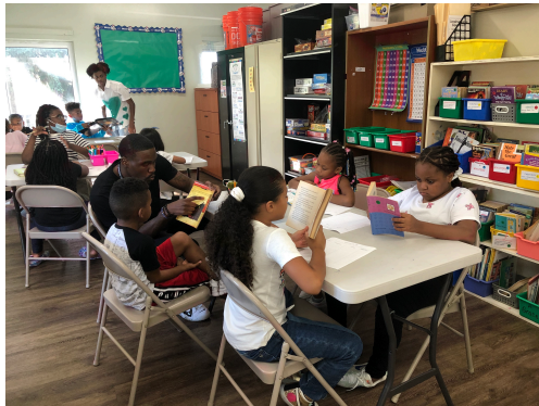
Reading time Grades K-5