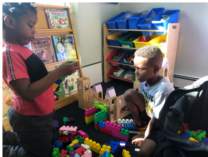
K-2 Problem Solving while Building