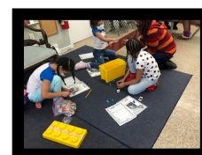
Students counted the number of lego used and drew a picture of their construction.