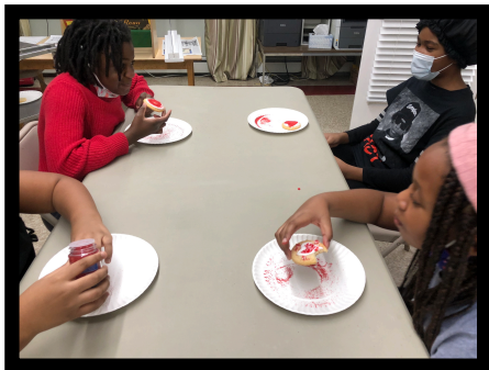
Students enjoyed decorating and eating their cookies.

1) Please let Mrs. S. know if your child is going back to school for the Hybrid Program OR if they are continuing with Remote Program at home.